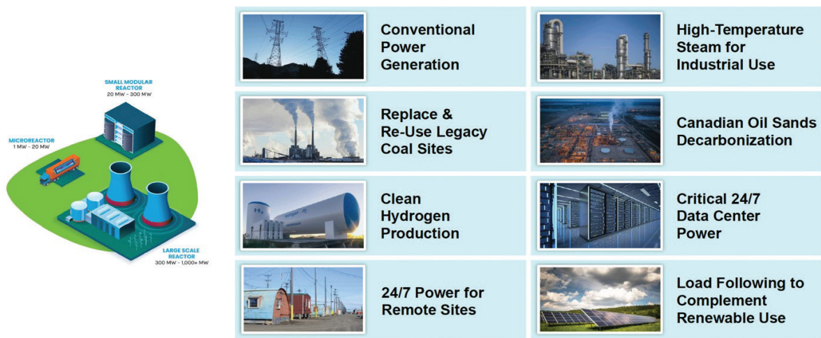
Figure 2: Range of applications that advanced nuclear can decarbonize.

Advanced reactor technologies are also capable of supplying high-temperature output for industrial requirements , and of powering hydrogen production and decarbonizations. The ability to provide energy for industrial productions will be critical to achieving decarbonization objectives. Furthermore, it may be feasible to use some of these additional energy requirements to balance the production of electricity for the grid, providing an additional source of flexibility for energy generation.